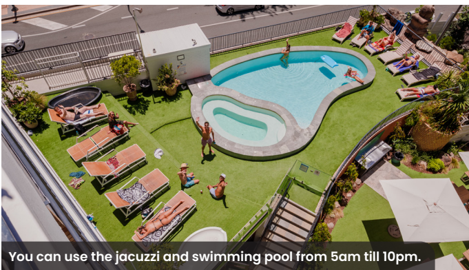
You can use the jacuzzi and swimming pool from 5am till 10pm.