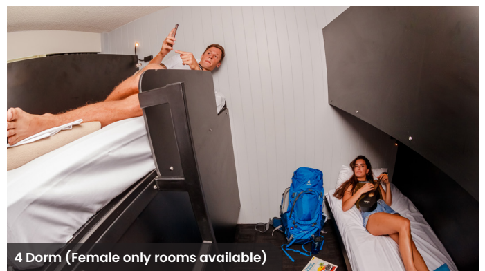
4 Dorm (Female only rooms available)