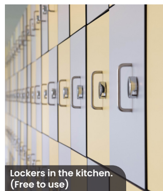
Lockers in the kitchen. (Free to use)