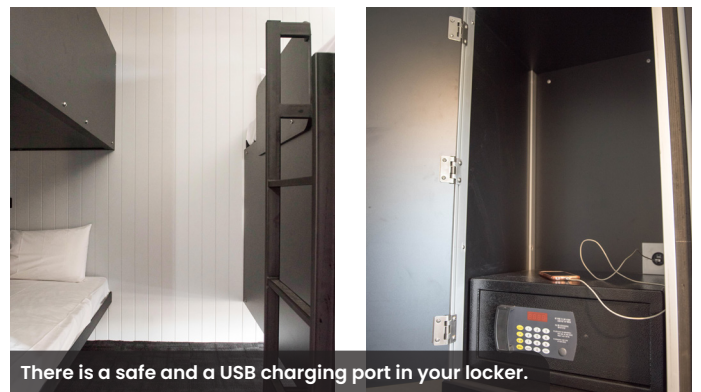
There is a safe and a USB charging port in your locker.