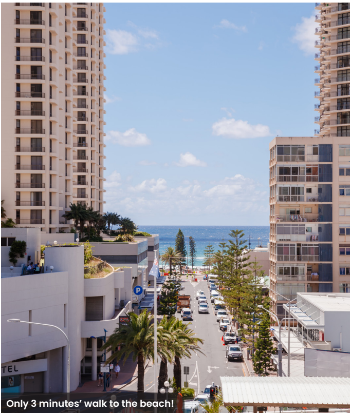
Only 3 minutes' walk to the beach!